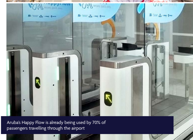
Aruba's Happy Flow is already being used by 70% of passengers travelling through the airport