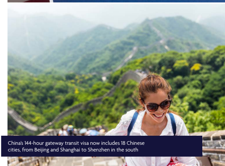
China's 144-hour gateway transit visa now includes 18 Chinese cities, from Beijing and Shanghai to Shenzhen in the south