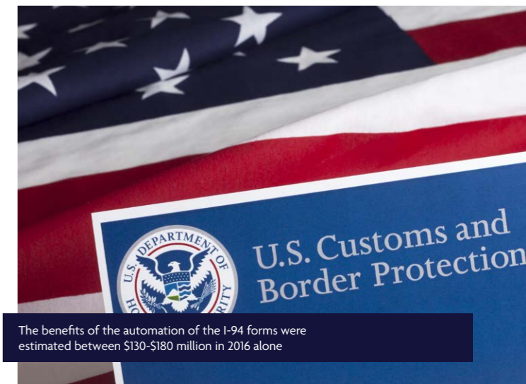
The benefits of the automation of the I-94 forms were estimated between $130-$180 million in 2016 alone

The initiative was designed to make the passenger process more secure and seamless. It was the result of cooperation between the Dutch and Aruban governments, the Aruba Airport Authority, Schiphol Group and KLM, in collaboration with the technology company, Vision Box. Aruba Happy Flow merged the border control process with the private passenger process at the airport. At present, 70% of passengers use the "Happy Flow", the remaining 30% being ineligible due to age, nationality, etc.